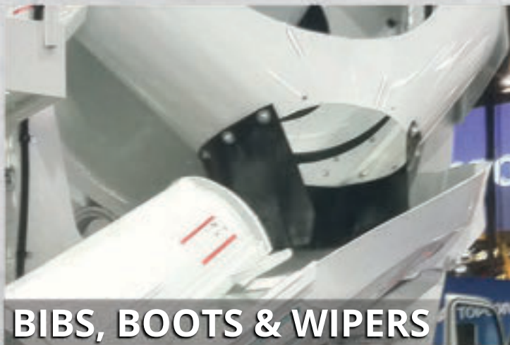
BIBS, BOOTS & WIPERS