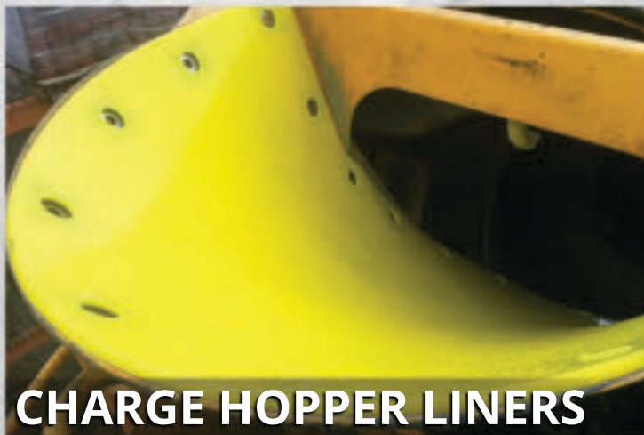
CHARGE HOPPER LINERS

Argonics' Kryptane ® polyurethane has superior abrasion resistance and washes down better than steel or rubber.