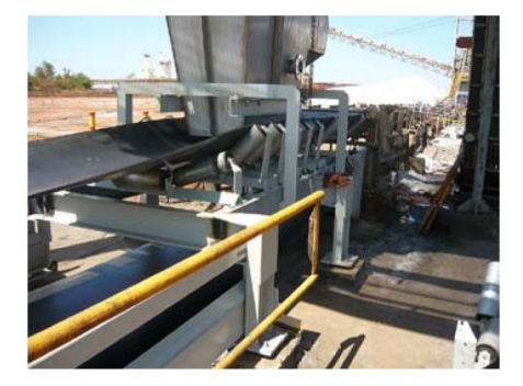
Above and below: Images of previous transfer chute set up.