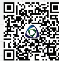
Technical Product Bulletin